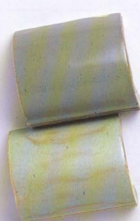
EG300 Frosted Green