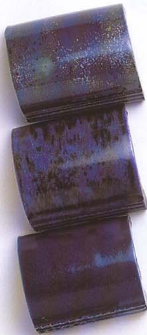
EG334L* Black Star