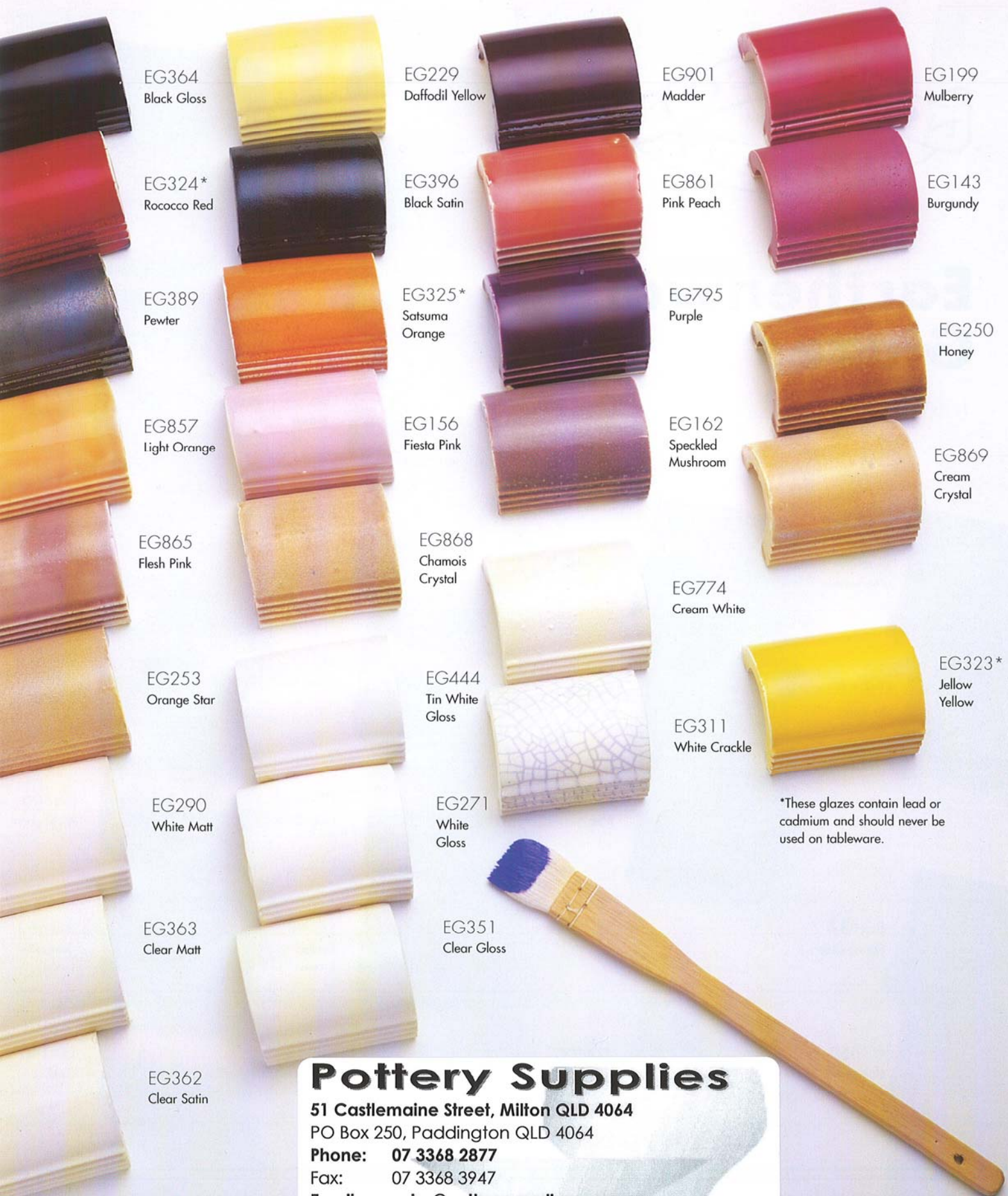
EG364 Black Gloss