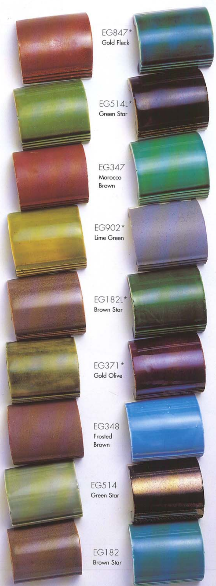
EG847* Gold Fleck